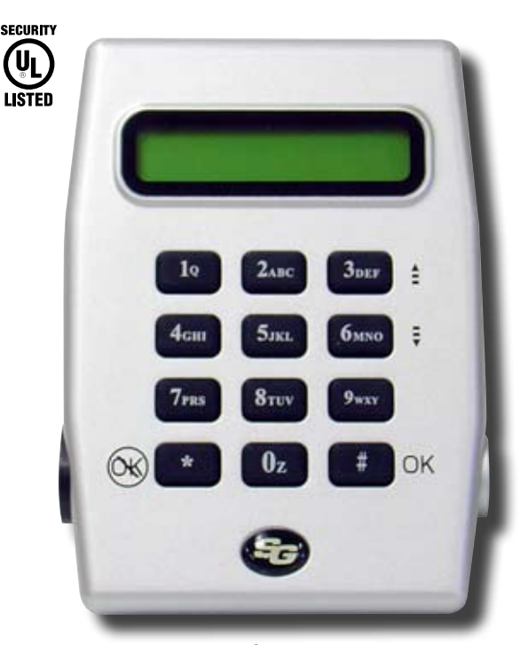
Powerful Safe Management